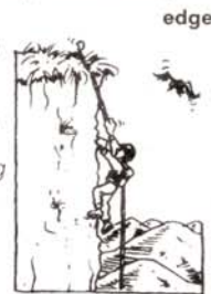
climbing on the edge of a cliff

a short way of writing or saying 'for example': You can try many different sports on this holiday, e.g. sailing, tennis, and swimming.