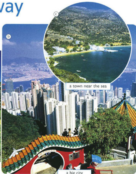
a town near the sea